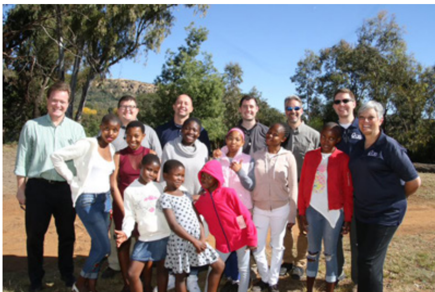
CRS delegation to Lesotho pose with girl participants in the CRS and Dreams program.

We left Baltimore for a 19-hour trip that concluded with a small plane ride. From my window seat, I could see the beautiful and enchanting mountains of Lesotho. They welcomed us with majestic colors and a peaceful beauty, a canvas that reflected the reality of its people. The airport was very small, the runway was ornate by the fields of tall dry corn and yellowing grasses affected by the winter weather already approaching. No buildings, or signs of much development around except the small customs building at the end of the runway. "Welcome Mae! Welcome Datè!" everyone greeted us with joy as we deplaned from the small stairs. Erica Dahl-Bredine, Country Representative, met us at the airport with two very courteous drivers. On the way to our first stop, Erica began to explain the work of CRS Lesotho, demographics, and some of the programming that CRS is doing in the area.