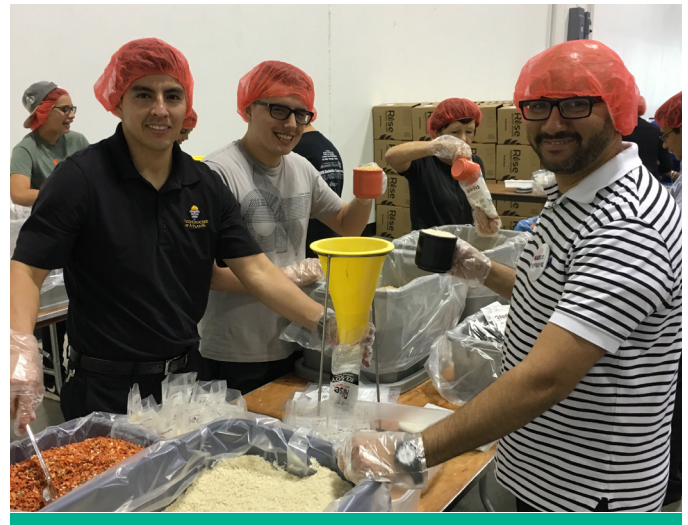
Archdiocese of Atlanta volunteers pack meals for the West African nation of Burkina Faso.

Over the course of 3 hours, 100,008 meals were packed for our global family in the West African nation of Burkina Faso. Every meal packed was another concrete expression of the Eucharistic Congress' call to action: The Eucharist commits us to the poor. Catholic Charities of Atlanta also set up their mock refugee camp to give meal packers a chance to experience some of what our displaced brothers and sisters around the globe are going through on a daily basis.