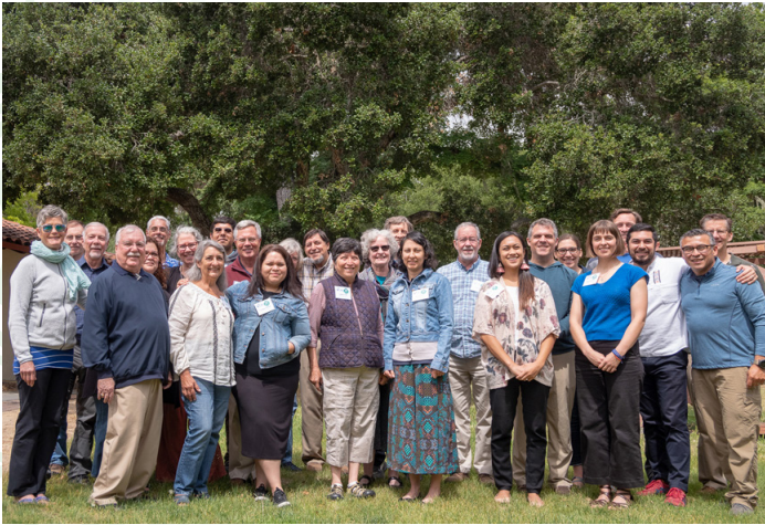
CRS West and Partners gathering May 29-31 at St. Francis Retreat Center, San Juan Bautista, CA.

CRS West staff met May 29-31 with 26 partners for two days to pray and reflect on CRS' mission and to plan for the coming year. The partners represented 12 key and active dioceses throughout the CRS West region. Notable among the groups were the diversity of key and long-standing partners: Life and Justice, Hispanic Ministries, Catholic Charities, seminary partners, California Catholic Conference, as well as relationships with CRS DDs, Rice Bowl Coordinators, Ethical Trade Ambassadors, PAC Animators, and parish ambassadors. There was also a diversity of ethnicities and ages represented, which led to a rich experience of connecting and sharing ideas and plans.