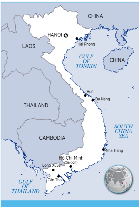
Above: Vietnam, located on the eastern coast of the Indochina Peninsula, has experienced significant economic growth, causing a widening gap between rich and poor. Far right: Thuan has learned to read and write through the support of CRS' Inclusion for Vietnamese with Disabilities program.