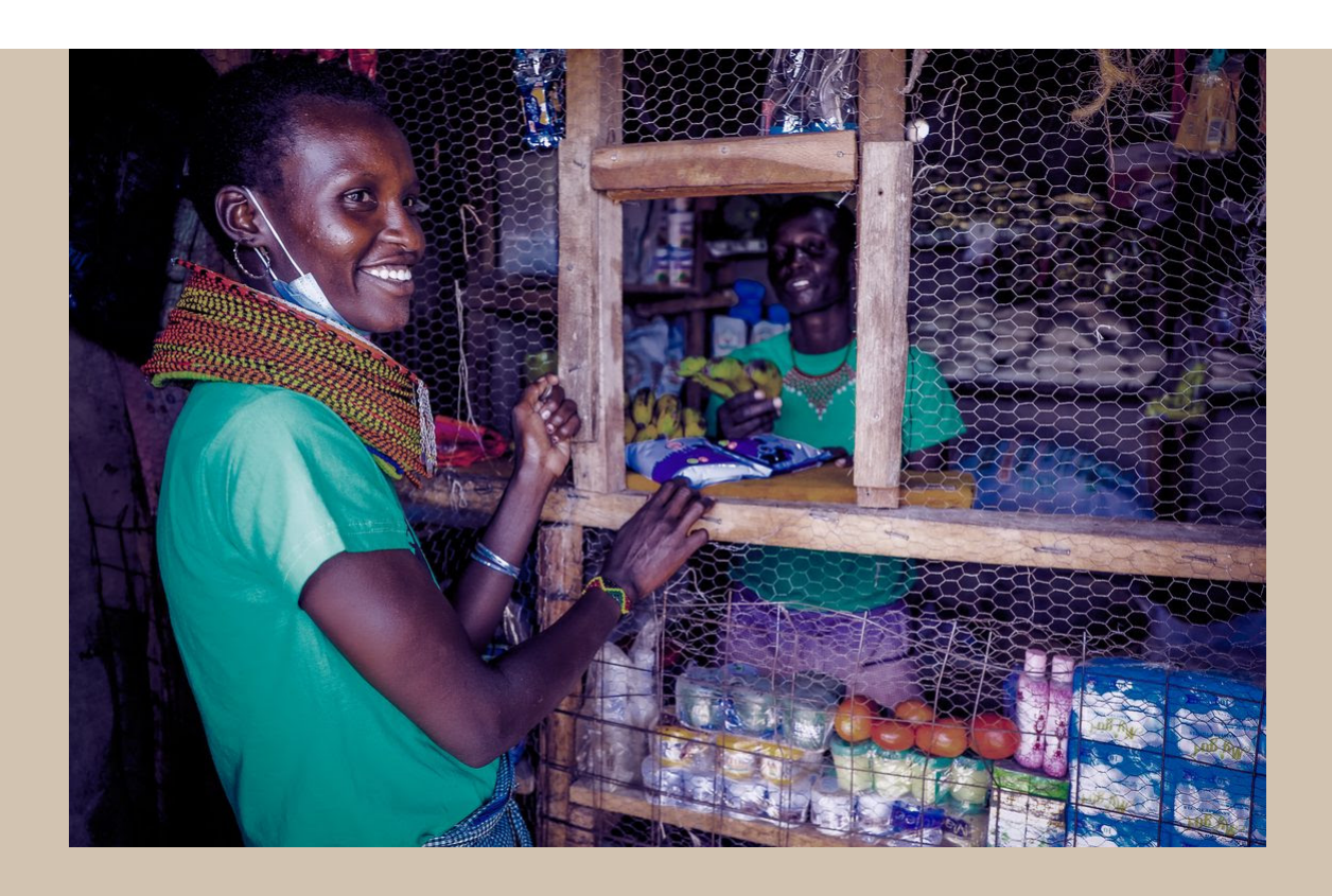
A member of the SILC group spends some of her share-out money on nutritious food for her family