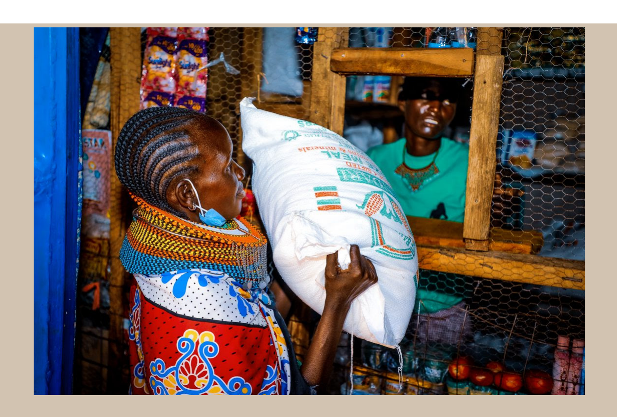
A member of the SILC group spends some of her share-out money on nutritious food for her family