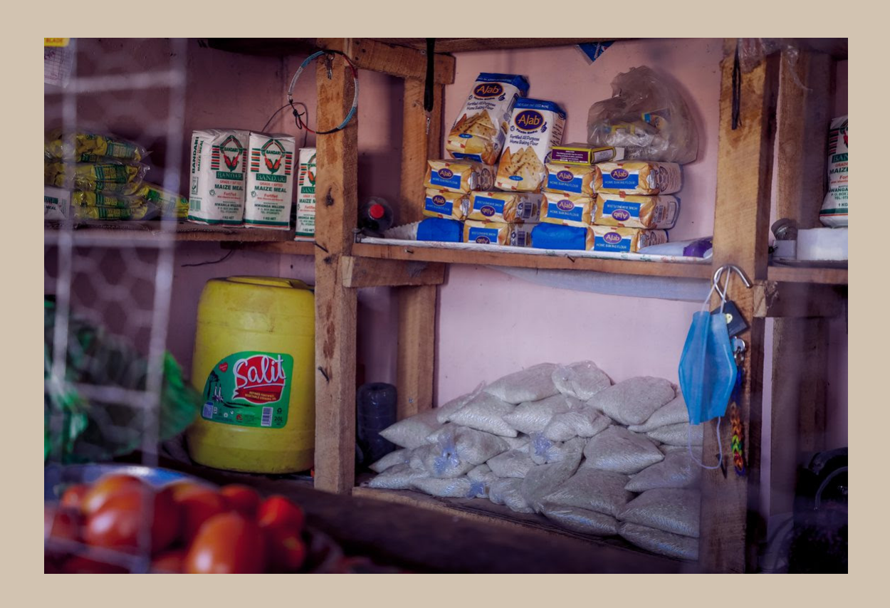
Last mile vendor shop in Ngaremara ward