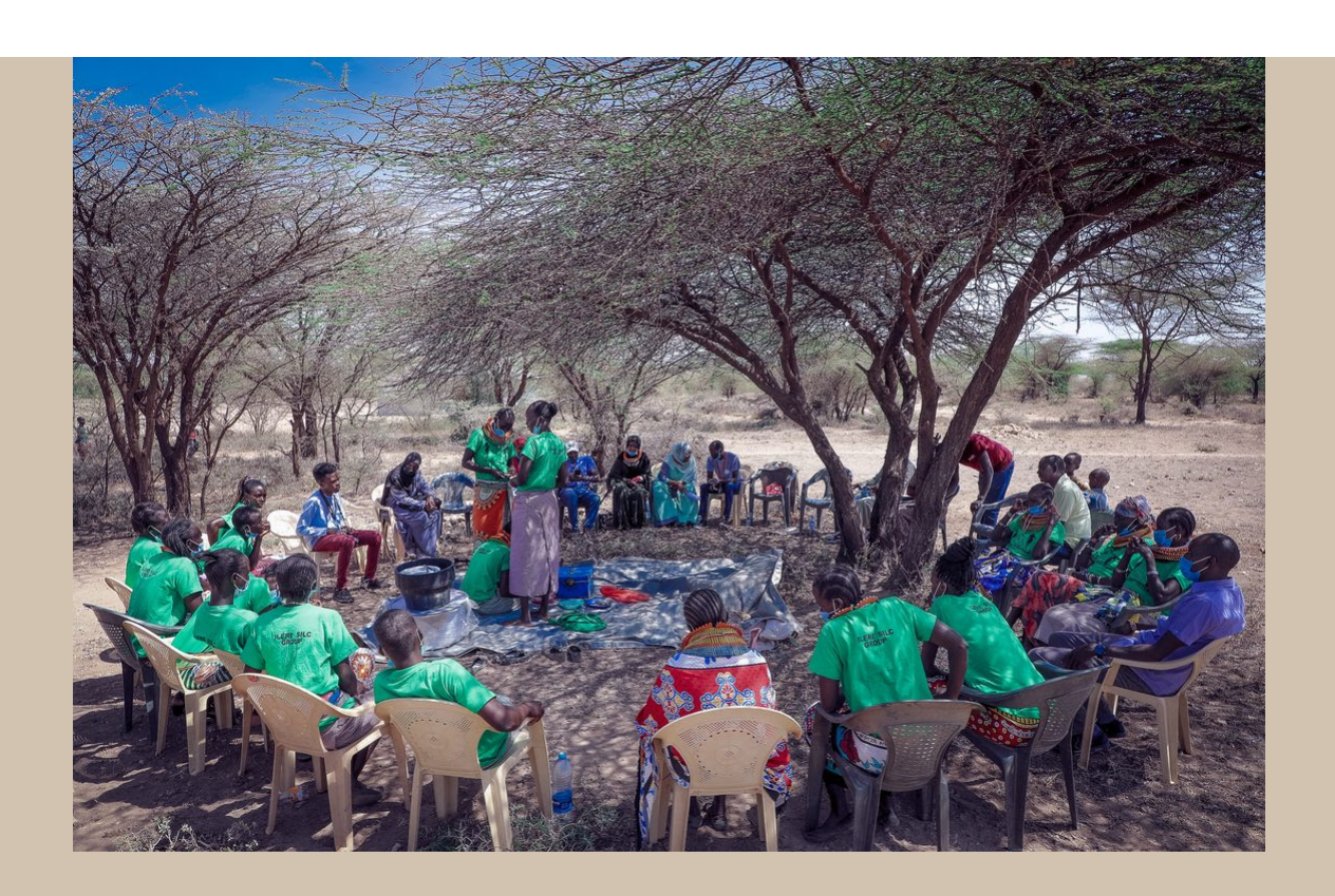
SILC Group members share-out in Attan village