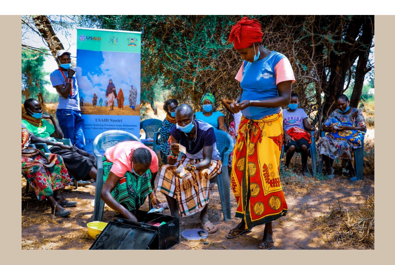
SILC Group members share-out in Ngaremara village