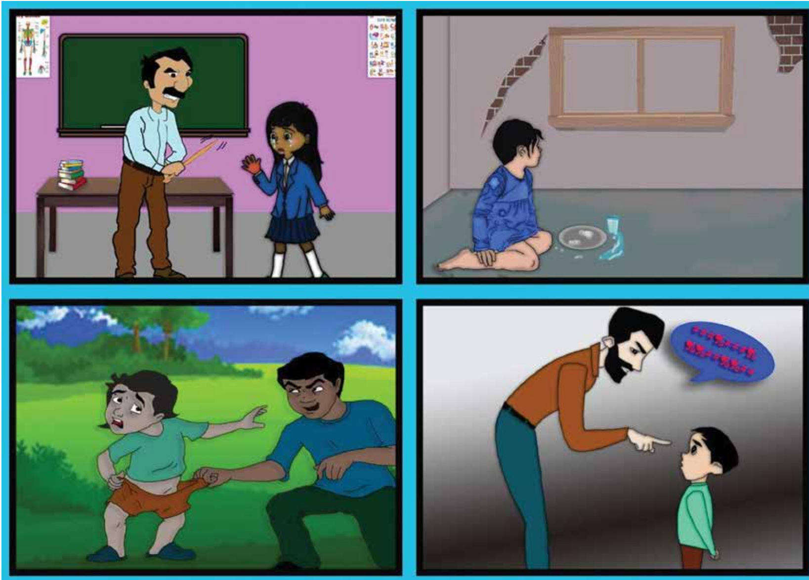
Illustrations of Abuse