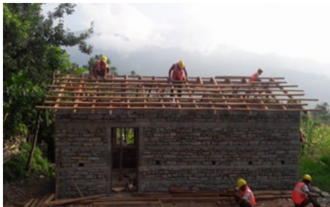
Participants of 50-days unskilled training busy in roof constructions of demo-houses at Aruarbang-4 in Gorkha district. CRS is making more than 90 demo-houses incorporating and highlighting all earthquake safe building elements so that the community can replicate to construct their homes making compliance to government norms and access the housing grant.