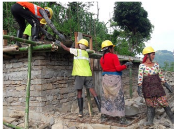
Female participants of 50 days vocational mason training with their male counterparts in Manbu-2 of Gorkha district organized by CRS. Females are highly encouraged and prioritized in the mason training events so that they can equally contribute in the housing reconstruction post 2015 Nepal earthquake. This 50 days unskilled mason training is tied up with demo-house construction.

Total population in the target area was approximately 90,000, with almost 25% meeting specific vulnerability criteria such as People with Disability (PWD) headed families, Dalit and Janajati (e.g. Maaji Communities from Central Region of Gorkha), Landless families or Families headed by elderly (>65years). For shelter activities, door-to-door technical assistance was given to all families reconstructing, regardless of status, but those families meeting some of the criteria above received additional support through livelihoods and Cash for Work programs.