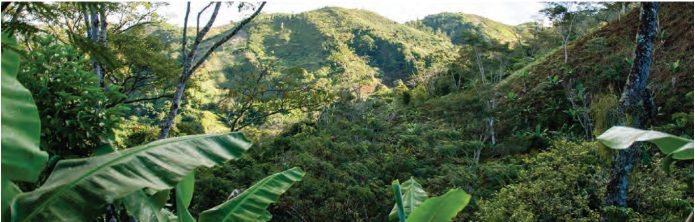
Landscape in Vatovavy Region

Adapted to ecological zones, SPICES promotes a people centered climate smart agriculture approach through agroforestry-based value chains that includes spices (vanilla, cinnamon, pepper), cacao, coffee, fruits, fuelwood among others within biodiverse agriculture landscapes. National and global markets have seen significant increases in the demand for Malagasy spices and products. These increased revenue streams allowing households to invest more in education, nutrition and health needs for their families. Tree nurseries run by local communities will also be enhanced with indigenous species that can serve to enhance the regeneration and protection of forest habitats and water catchments within targeted landscapes that serve to directly benefit agriculture production.