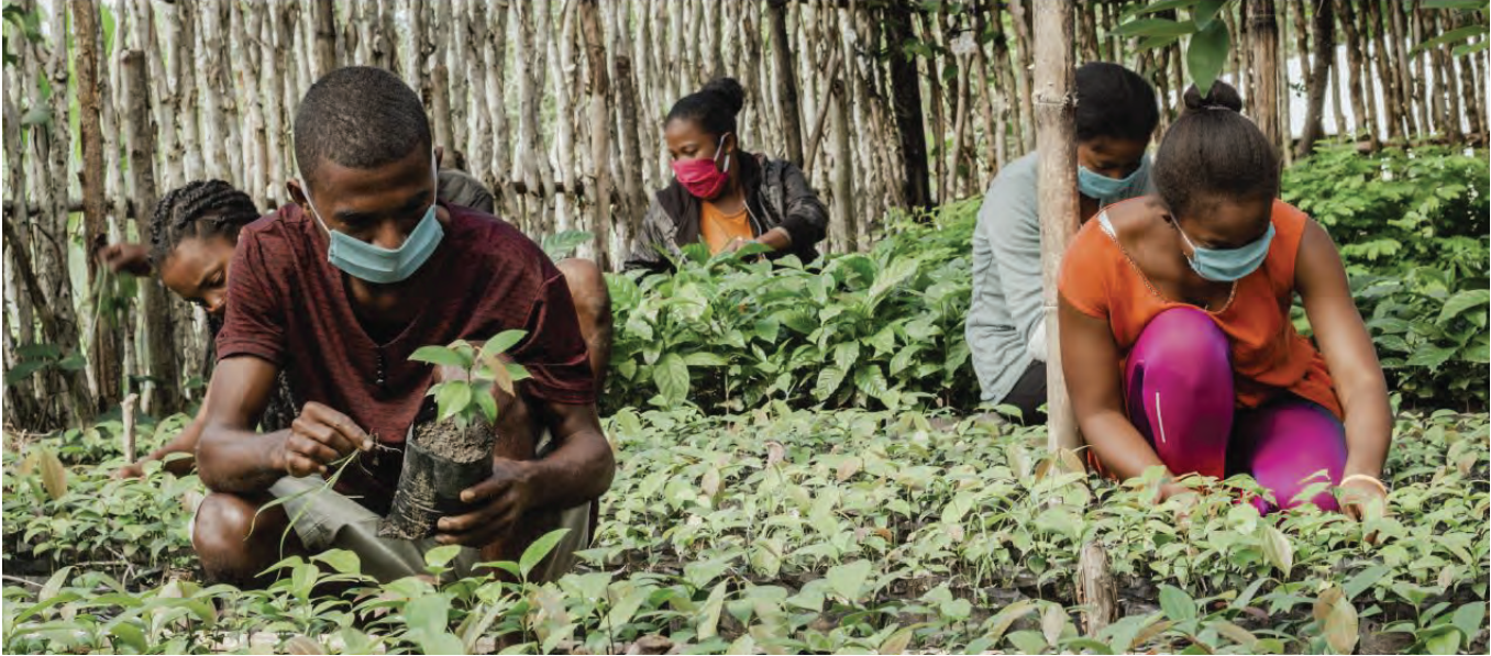
Youth group in nursery for a reforestation activity in Mananjary (Vatovavy Region)

SPICES engages and mobilizes young men and women to understand the opportunities along the nature-based value chains from production to consumer as well as being key stewards of the environment in their communities. Education, training and leadership opportunities, employment readiness and entrepreneurship will be prioritized. By gaining basic financial skills through CRS' Savings and Internal Lending Committees (SILC) approach, leadership & life skills, vocational training and business management competencies, youth will be able to directly engage and invest in agriculture-based livelihoods and economic opportunities. SILC also helps with resource management at the household to better save and invest for education, health and nutrition needs. These next generation farmers and leaders will help to lead the way for more long term community development. Working with local partners is also important for SPICES to build off local experience and expertise. Centre ValBio (CVB) will lead work on biodiversity and the production of endemic trees while the Organe de Developpement du Diocèse de Toamasina (ODDIT) will lead community based activities in the east.