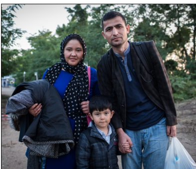
Refugees from Afghanistan at the Serbia/Croatia border.

Passionate about advocacy? Take Action Now . Protect funding for refugees and migrants. Support Dreamers by passing the Dream Act (H.R. 3440/ S. 1615). Call on Congress to act now. (Also available in Spanish: https://support.crs.org/act/compartiendo-el-viaje )