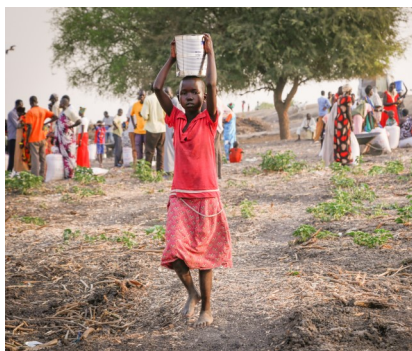
Displaced families receive food in Duk County, South Sudan

This global emergency update provides the latest snapshot of CRS' ongoing relief and development activities around the world.