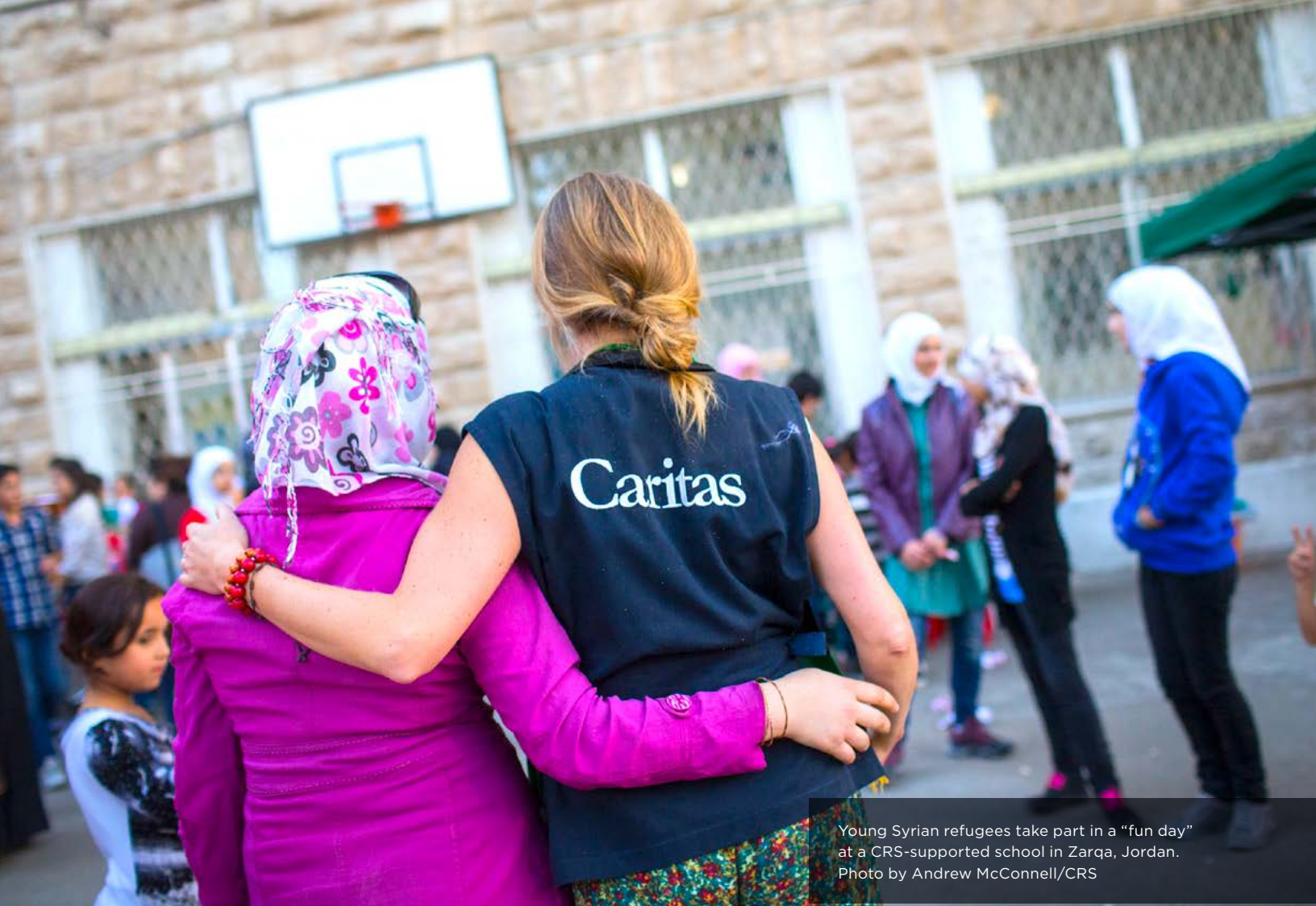
Young Syrian refugees take part in a “fun day” at a CRS-supported school in Zarqa, Jordan.

needs, but the selection of beneficiaries depended on the employee in the field.” Another LFI, having authored and adopted a Child Protection policy, set up an internal committee on child protection standards, to regularly review their programming and to discuss options for improving their work by, for example, attending trainings. Another LFI, became a reference point on SPHERE across the whole region.