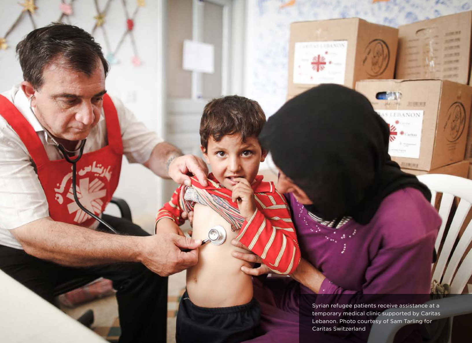
Syrian refugee patients receive assistance at a temporary medical clinic supported by Caritas Lebanon.