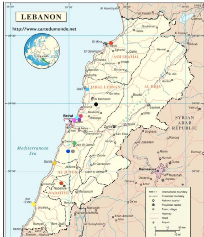
Country map of Lebanon and location of PEER-participating Local Faith Institutions. The map shows the headquarters of the 14 LFIs. Some of the organizations have programs that spread across the country, and in some cases, are present in Syria as well.

In March 2017, the Lebanese Prime Minister Saad al-Hariri said Lebanon was close to a "breaking point" owing to the protracted nature of displacement. 16 According to the United Nations, Syrian refugees in Lebanon are more vulnerable than ever, with more than half now living in extreme poverty and over three quarters living below the poverty line. Nine out of every 10 refugees state they are in debt and food insecurity remains critically high. Lacking the ability to obtain legal residency, refugees are exposed to an increased risk of arrest, hinders their ability to register marriages and births, and makes it more