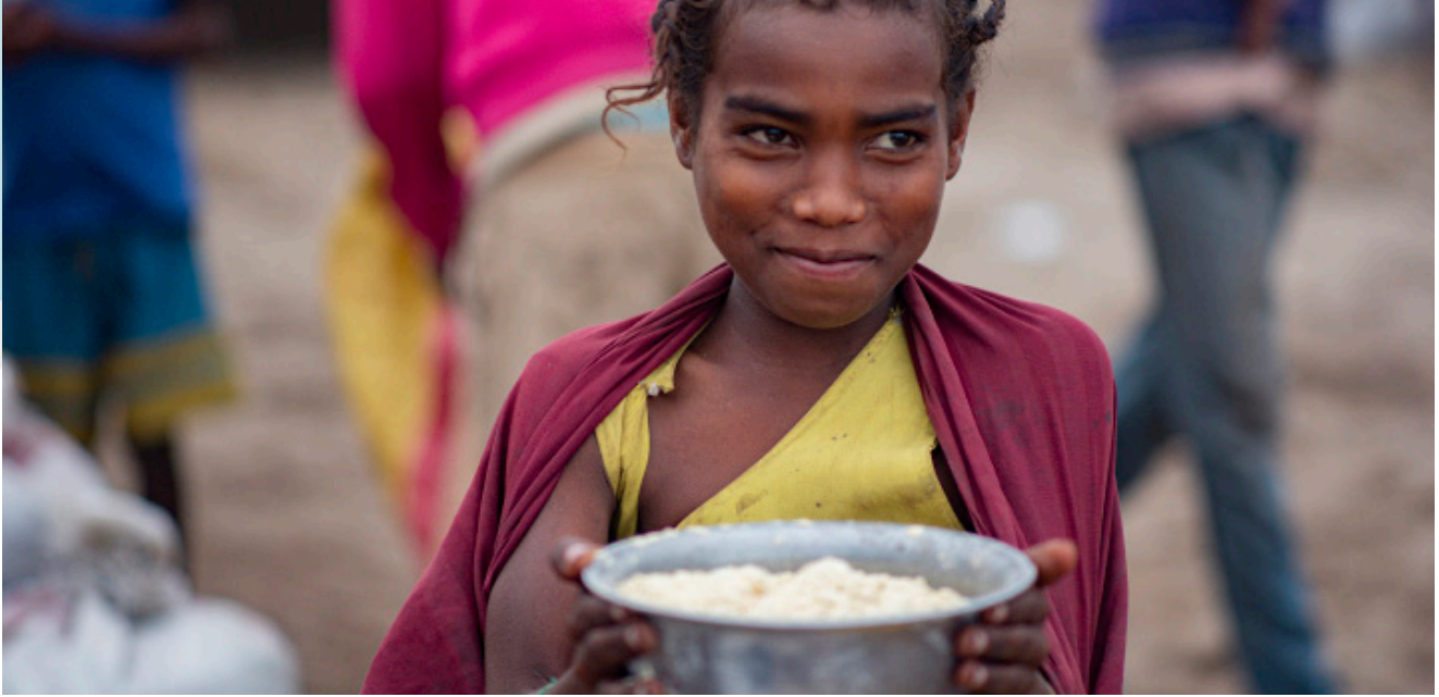
Food distribution in the Fonkotany of Katravitra ( Marovato Commune, Tsihombe District) as part of the Maharo project funded by USAID's Office of Humanitarian Assistance and led by Catholic Relief Services. The items distributed included sorghum, yellow split peas, corn soy blends, and vegetable oil. The project aims to reduce food insecurity in the region for five years (2019 - 2024).