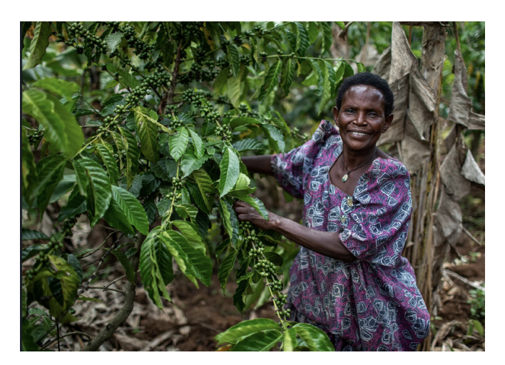
CRS is developing innovative approaches for scaling landscape restoration to improve livelihoods and build climate change adaptation and mitigation capacities.

CRS is a strong competitor in the health, social services and agricultural livelihoods sectors, but these are saturated with other organizations. CRS is respected for its systems strengthening work with government and private actors in these sectors. The Ministry of Gender, Labor and Social Development says CRS was key in strengthening institutional child protection systems in relation to its globally tested models, and