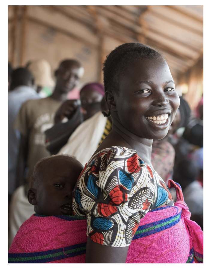
A woman waits to be registered at Bidi Bidi Refugee Settlement in northwestern Uganda. Uganda hosts the world's third-highest number of refugees. CRS works with refugees, hosting communities and non-hosting communities.

CRS also needs to strengthen its approach to, and marketing of, partnership and capacity strengthening. In the past, CRS succeeded in building capacity; now, it needs to invest more time and resources in institutional strengthening and accompaniment to fully support strategic partners, including the Church. A detailed Partnership and Capacity Strengthening Strategy outlines key actions to strengthen CRS' work in this area.