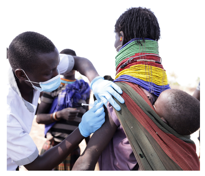
Residents of Moroto District in northern Uganda receive COVID-19 vaccinations following CRS' project to ensure vaccinations could be administered close to where people live.

Uganda has considerable potential, yet faces tremendous challenges in achieving NDPIII goals. CRS, with its strong reputation and track record of success, can play a significant role in the future development of the country.