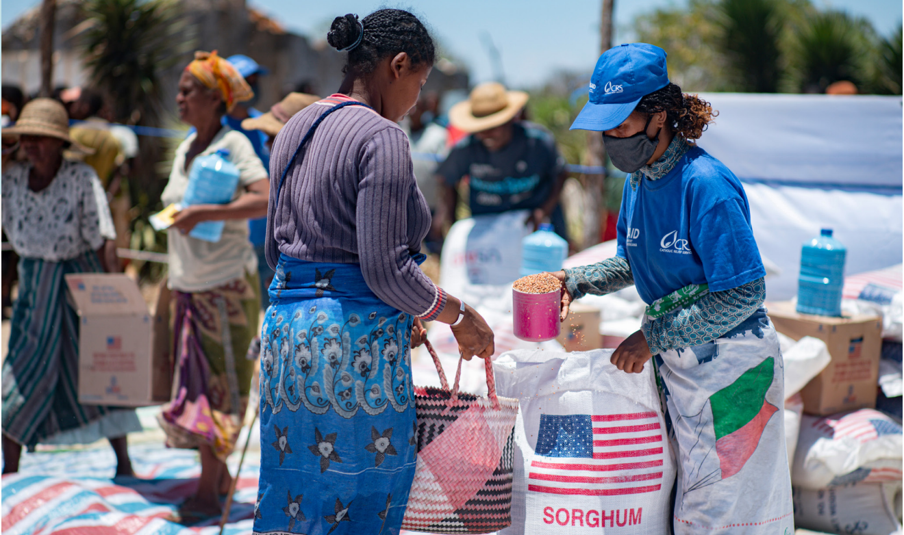
Food distribution is among the emergency response activities implemented by Catholic Relief Services (CRS) and funded by the United States Agency for International Development (USAID) in southern Madagascar. To assist vulnerable households in the face of the recurring drought and food insecurity crisis, a variety of food items are being distributed, including sorghum, yellow split peas and vegetable oil.