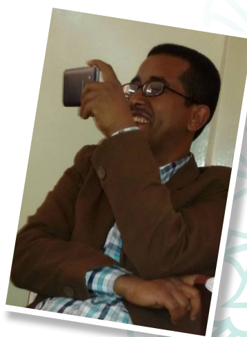
Taking a selfie!