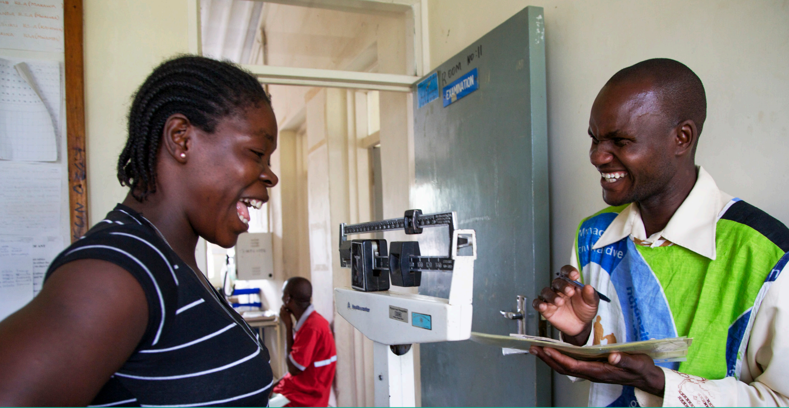
Woman shares a laugh at her checkup after an HIV support group meeting.