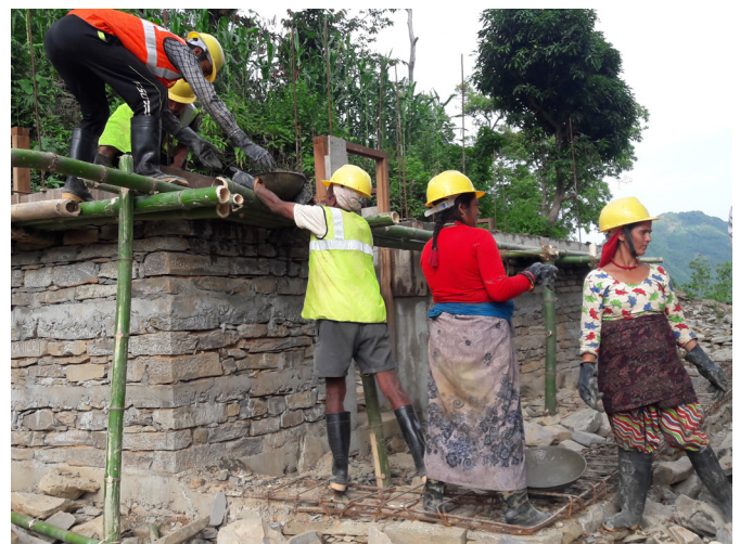
Female participants of 50 days vocational mason training with their male counterparts in Manbu-2 of Gorkha district organized by CRS. Females are highly encouraged and prioritized in the mason training events so that they can equally contribute in the housing reconstruction post 2015 Nepal earthquake. This 50 days unskilled mason training is tied up with demo-house construction.

Total population in the target area was approximately 90,000, with almost 25% meeting specific vulnerability criteria such as People with Disability (PWD) headed families, Dalit and Janajati (e.g. Maaji Communities from Central Region of Gorkha), Landless families or Families headed by elderly (>65years). For shelter activities, door-to-door technical assistance was given to all families reconstructing, regardless of status, but those families meeting some of the criteria above received additional support through livelihoods and Cash for Work programs.