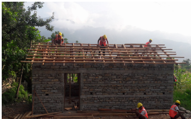
Participants of 50-days unskilled training busy in roof constructions of demo-houses at Aruarbang-4 in Gorkha district. CRS is making more than 90 demo-houses incorporating and highlighting all earthquake safe building elements so that the community can replicate to construct their homes making compliance to government norms and access the housing grant.