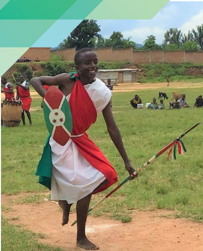
Burundian youth use dance and theatre to promote social cohesion in the wider community.