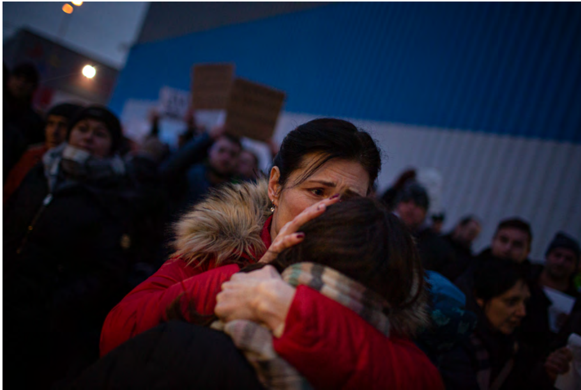
Ukrainian family members arrive at the border with Poland.

As reports emerge of families being displaced by the recent attacks in Ukraine, Catholic Relief Services is helping Caritas teams prepare to respond to urgent humanitarian needs across the country—including for evacuation, food and safe shelter—while taking every precaution to ensure the safety of their staff.