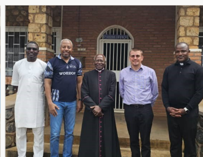
The delegation with the Vicar General of the Bamenda Archdiocese.