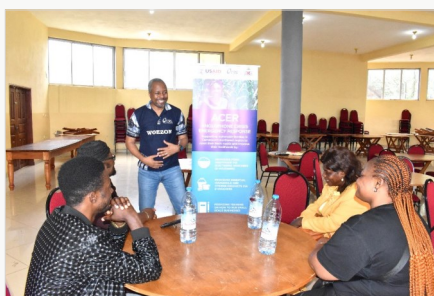
The Regional Director exchanges with ACER participants at a business skills training