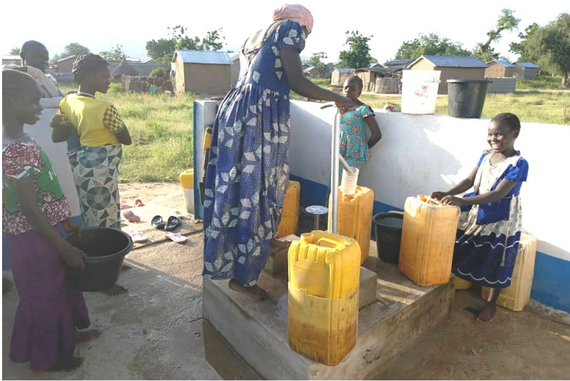
An operational borehole constructed by the STaR II project in Mozogo village in the Far North of Cameroon.