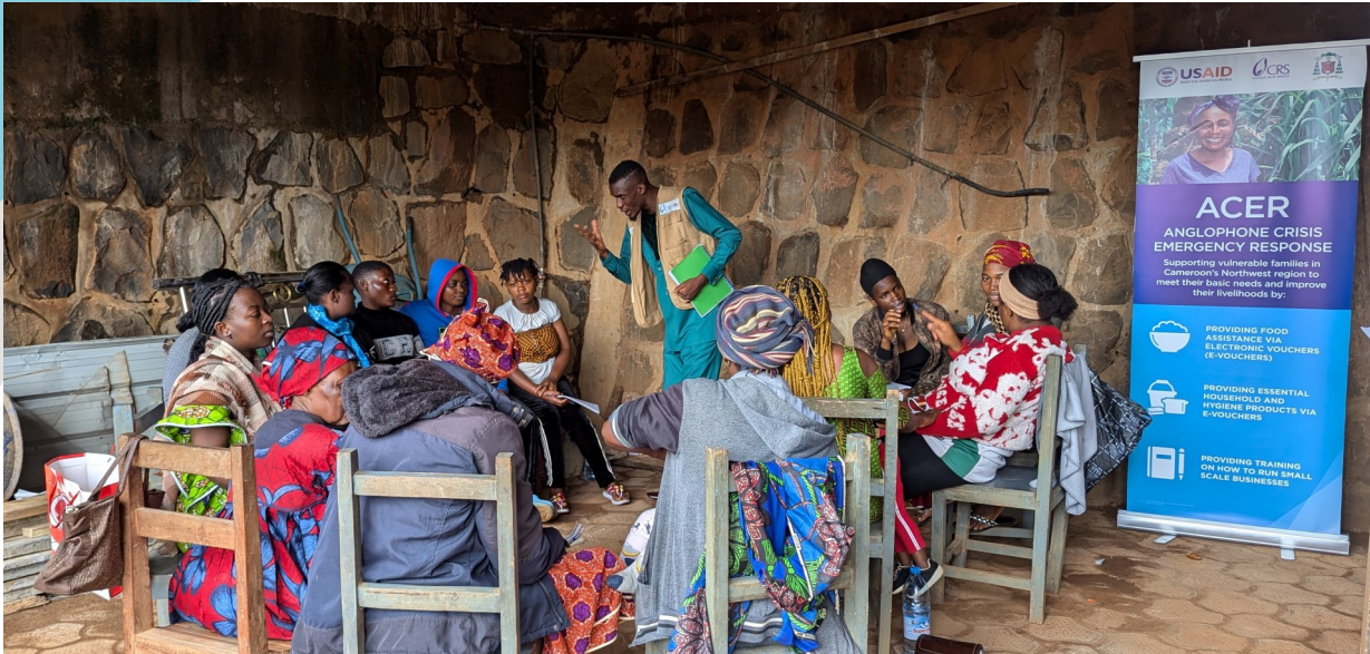
Participants of the ACER project attend a training on business skills in Bamenda, Northwest Region of Cameroon.