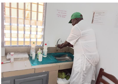
The Head of the Kossehonne Health Center, washing his hands with running water from the mini-water supply system.

To ensure sustainability of the water facilities, CRS created management committees. These committees have been trained in self-management, safety, hygiene and sanitation.