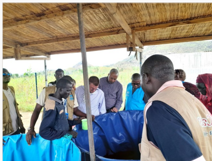
The Regional Director, Country Representative and UNHCR officials visit the Minawao Refugee Camp.

The Regional Director praised the staff for their dedication in delivering the most needed support and services to participants living in very vulnerable conditions and in high-risk areas.