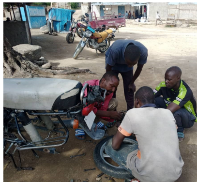
Four project participants who learned mechanics received tool boxes from the project. They were offered space by their trainer to start a little garage in which they have begun repairing motor bikes in the village to earn a living.