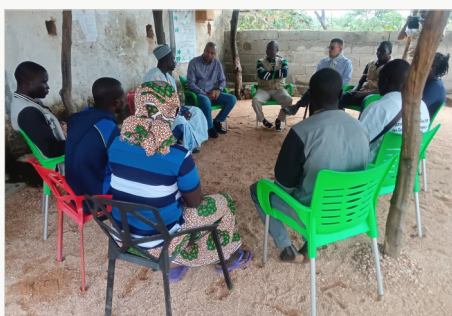
The Regional Director and the Country Representative exchange with the Chief of Gorai and project participants.