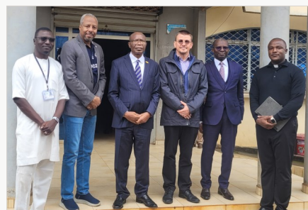
CRS officials meet with the Governor of the Northwest Region