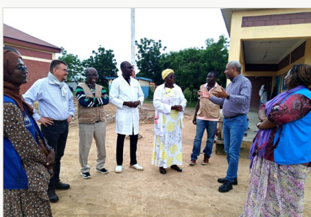
CRS officials exchange with the UNHCR team at the Minawao Refugee Camp in Maroua.