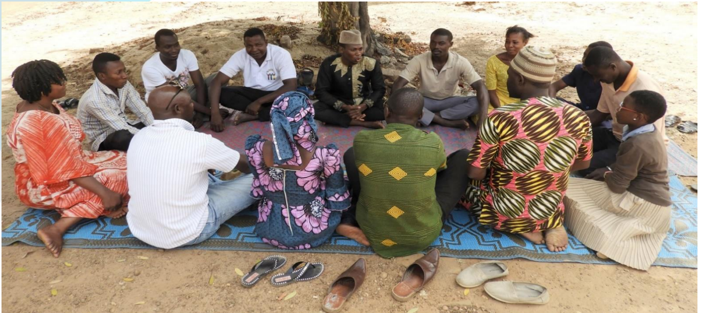
Members of the youth committee for the Sokodé Youth Working for Social Cohesion program planning cultural events as part of community sensitization to promote peace.