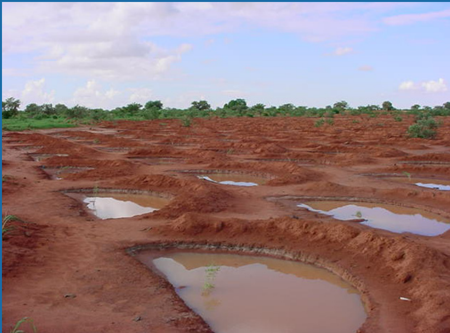
Water captured by recently dug half moons. Souradja Mahaman