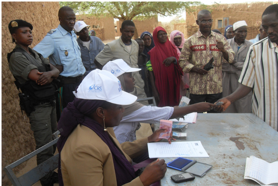
Bank officers pay CFW participants as CRS staff monitor the activity.

Because this is community led work and because the national policy does not permit some members to be paid more than others regardless of the