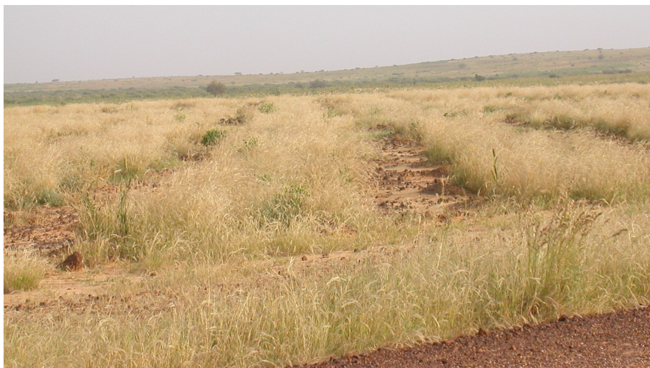
Re-fertilized land: The same recuperated land demonstrating evidence of improved fertility. Souradja Mahaman