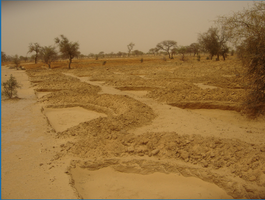
Freshly recuperated field of half moons outside Daibery, Tillabery.