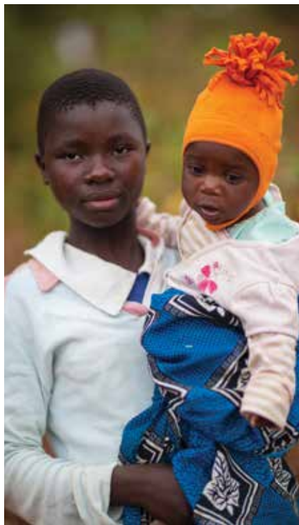
Primary school girl, daughter of the WALA beneficiaries, carrying her sibling.

a local church's women's guild. Some made reference to the governance training as important for building leadership and conflict-management skills. They expressed appreciation for learning how to deal with different personalities and group conflicts.