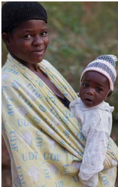
Chilies grower and a member of VSL who also benefits from WALA Maternal and Child Health & Nutrition interventions.

This assumption may create resentment from men who do not understand why they are not benefiting and/or undermine their support to their wives and fellow female peers.