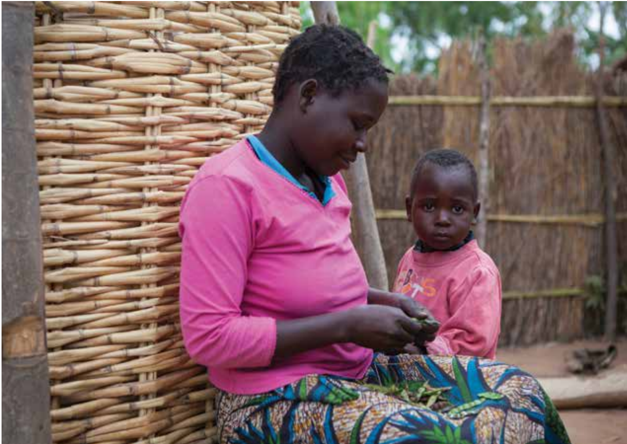
WALA Farmer and a child unpeeling fresh pigeon pods to prepare a peas meal.