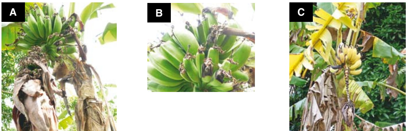
Figure 5: Failure to remove dead flowers and male bud [A] provides incubation sites for pathogen causing cigar end rot [B] and entry sites for Xanthomonas wilt [C]. Early removal of male bud can provide a solution to both BXW and cigar end rot diseases.

Cigar end rot (CER) is caused by one of two fungi, either Verticillium theobromae or Trachysphaera fructigena . Both pathogens exist in Central Africa with the latter being more common. In recent surveys, CER was common in northwestern Rwanda, some areas in Burundi and eastern DR Congo. The disease causes a black necrosis spreading from the perinth into the tip of immature fingers, and the pulp undergoes a dry rot. The infected tissues are covered with fungal mycelia that resemble the grayish ash of a cigar end. The rot spreads slowly and rarely affects more than the first 2 cm of the fingertip. Incidence is highest during the rainy season. The pathogen colonizes banana leaf trash and flowers, from where spores are disseminated in air currents to other drying flower parts (Figure 5B). T. fructigena causes premature ripening of fruits, and