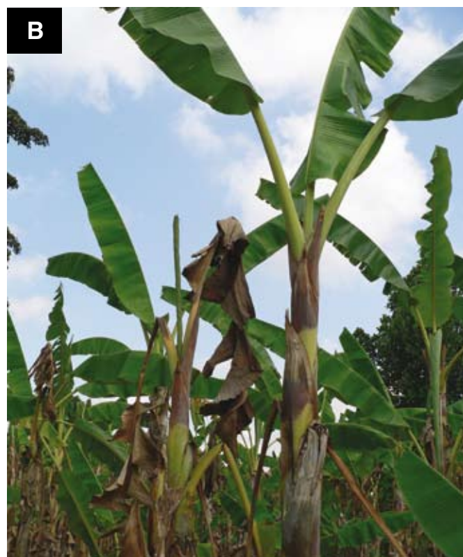
Figure 4: Leaves infected with Black leaf streak ( Sigatoka ) [A] should be removed regularly to reduce inoculum sources and shading which creates suitable microclimates. Precautions should be taken to avoid spreading Xanthomonas wilt through tools when removing leaves [B].