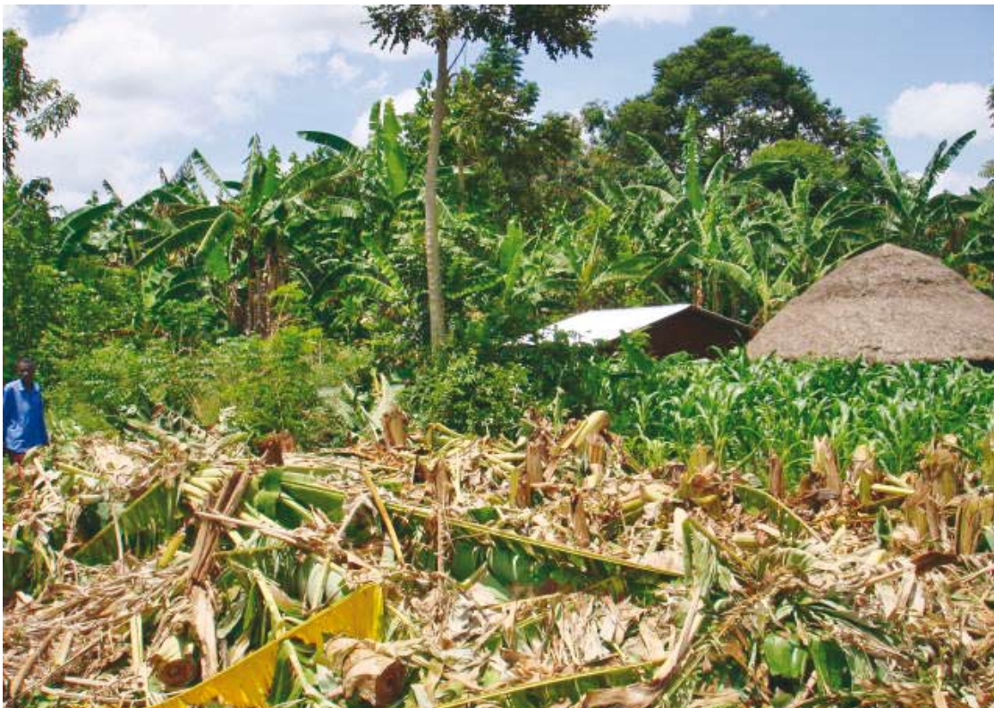
Removal of diseased banana crop

While the focus in C3P is on management of Xanthomonas wilt, a variety of biotic constraints will continue giving major challenges to production of banana and plantains in East and Central Africa. Helping farmers to produce and use healthy planting suckers will have far-reaching effects beyond the management of BXW. Thus, the single investment made to promote macropropagation can have a multiplier effect with regard to management of biotic constraints. Considering the evolving nature of biotic constraints and their variability within regions and agro-ecologies, extension messages must be tailor made for the target audience and extension practitioners require regularly updated information on pests and disease threats. Governments in the region also need to continuously invest in technology and development of human capacity to ensure rapid and appropriate diagnosis of pests within their territories.