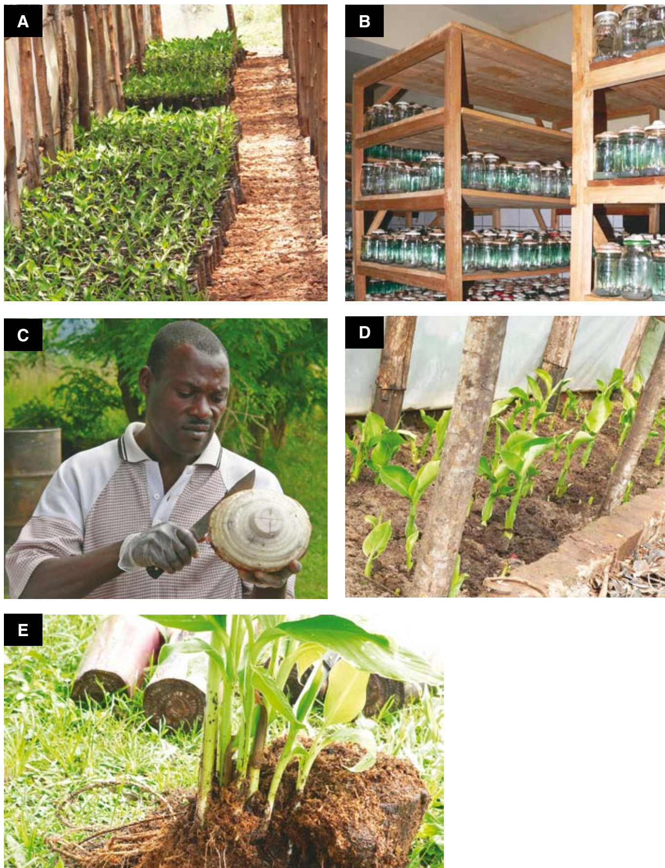
Figure 8: Planting healthy suckers [A] produced by tissue culture [B] or macropropagation [photos C, D & E] is one of the most efficient ways of preventing spread of pests and diseases.