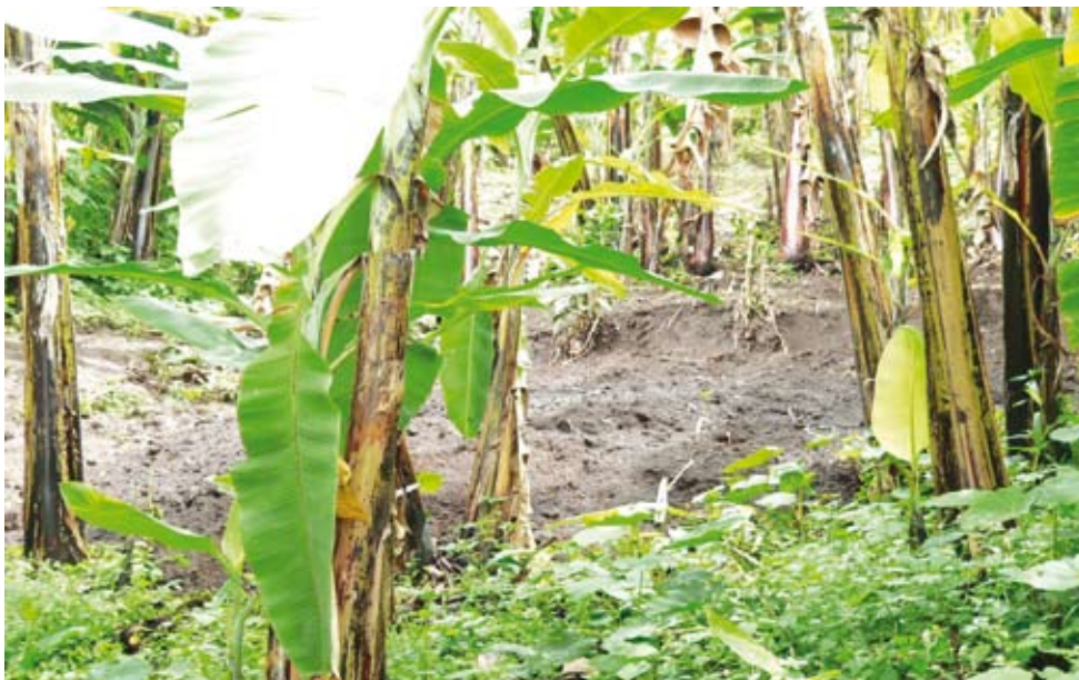
Figure 2A: sporadic removal of infected mats (only one or few mats removed) presents less risks to environment.

The Xanthomonas pathogen can infect banana plants through various ways, and disease management strategies are most effective when based on knowledge of the mechanism of disease spread.