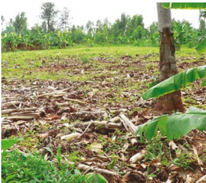
Figure 2B: total removal of mats on flat land presents little environmental degradation risk.