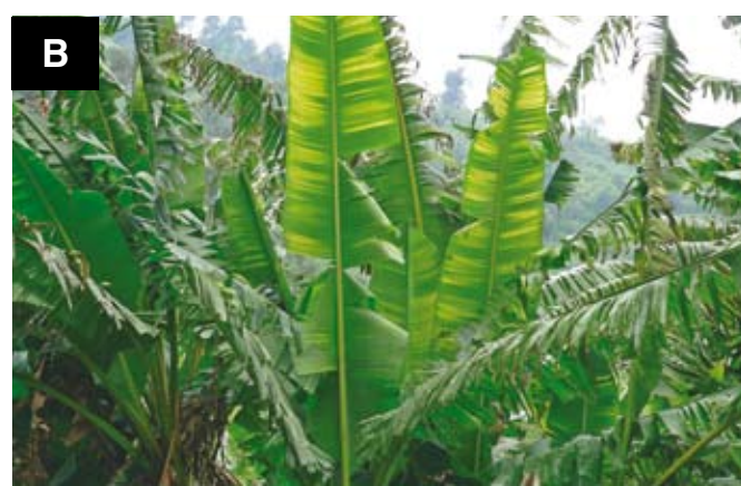
Figure 6: Banana bunchy top [A] and streak virus infection [B]. Both diseases can be effectively contained through use of healthy planting suckers.