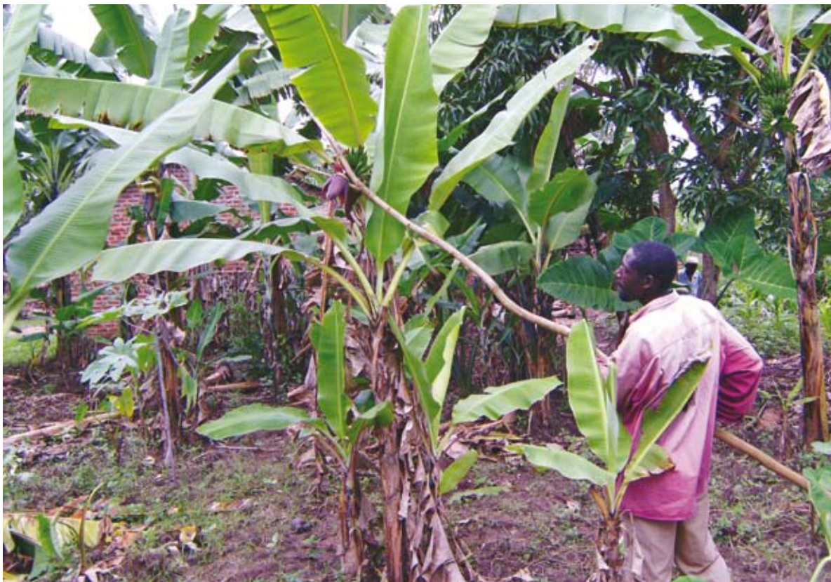
Figure 1. Farmer debudding male flower.

On the other hand, multiple pathogens and pests present unique opportunities for developing, testing and implementing solutions with multiple targets. For example, eradication of mats infected by BXW also knocks off all pests that depended on such mats for survival, while planting healthy seed prevents spread of all pests that are transmitted through suckers. Regional coordination efforts targeting one pest, e.g. BXW, could also be broadened to include policies for all pests with a transboundary character. Therefore, in the Crop Crisis Control Project, management strategies for BXW need to be conscious of the other pests and diseases, and where possible, activities should be integrated to address holistically the maximum number of constraints from this single investment. Some of the key diseases and pests in the Great Lakes region are highlighted below.