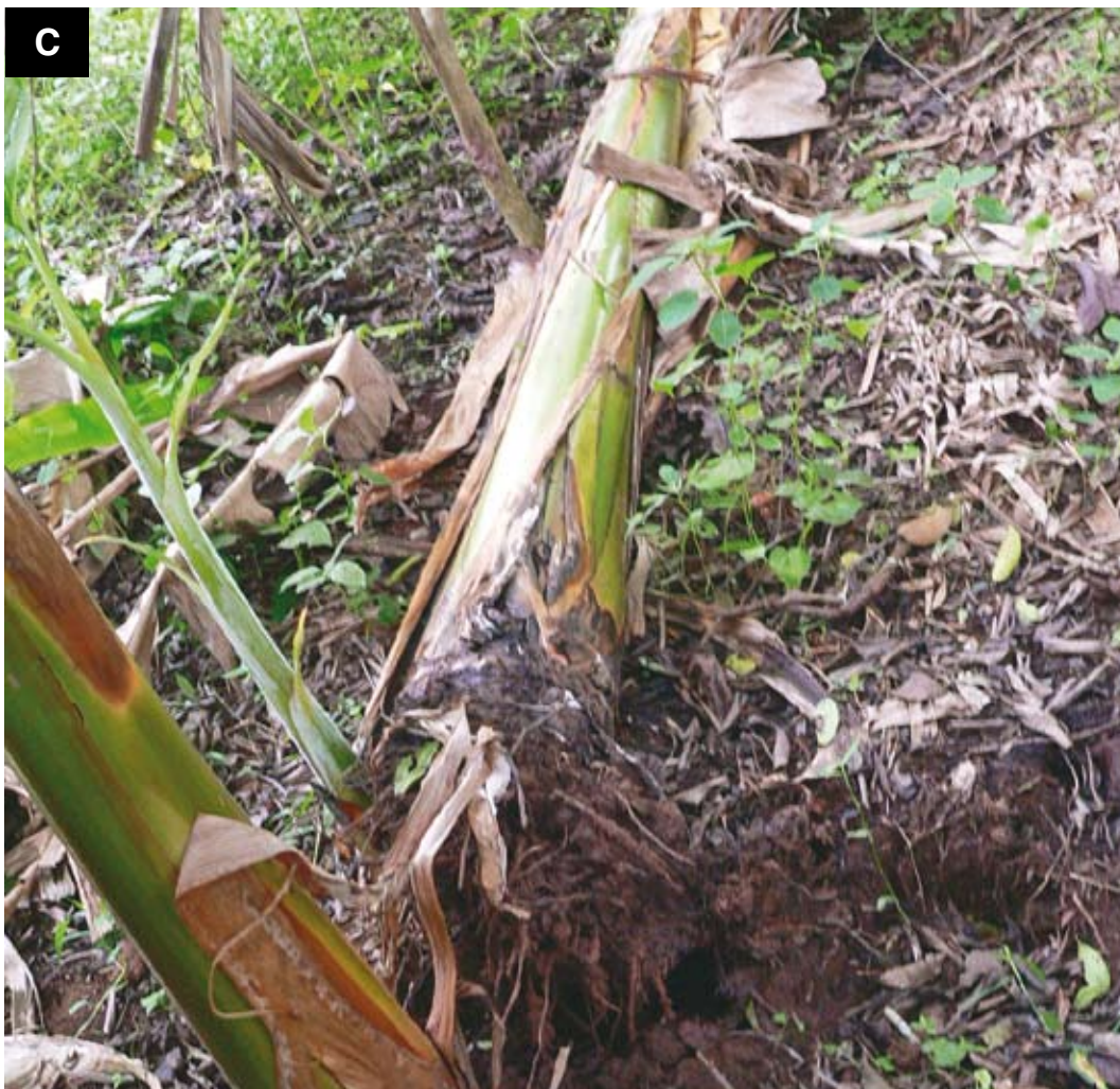
Figure 7: Weevils damage to roots and corm [A] can facilitate spread of Xanthomonas wilt [B]. Nematodes damage roots and cause toppling of plants prematurely [C]. Nematodes and weevils are effectively managed by use of healthy planting suckers and crop rotation.