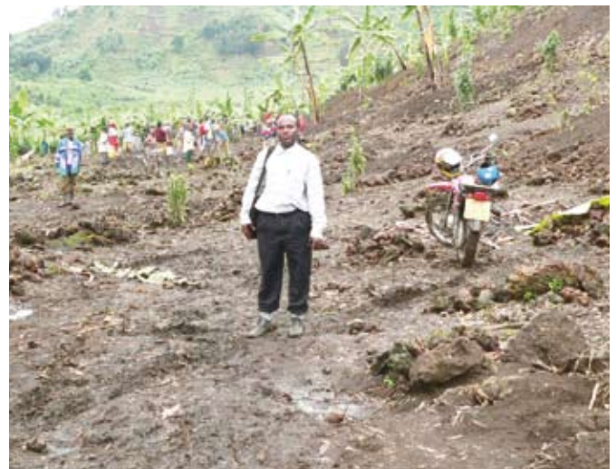
Figure 2C: total removal of mats on hillsides presents the greatest risk for environmental degradation. Measures must be taken to protect the soil before banana mats are removed.