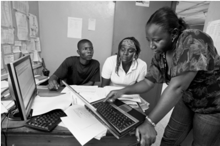
AIDSRelief emphasizes the application of that data in all facets of patient care and site management. At St. Gerard's, a pharmacist, a physician, and a program manager discuss the pricing of medicines.

assistance helped create a culture of timely, data-driven information use that has transformed management and patient care. To help keep trained staff at facilities and to improve the effectiveness of information teams, AIDSRelief and supported facilities empowered and strengthened the capacity of staff to analyze and present data at monthly site-level meetings. M&E officers also participated. In many cases, information officers even identified clinical concerns that providers had not yet noted. These types of efforts have helped information staff take pride in their roles and improve patient care.