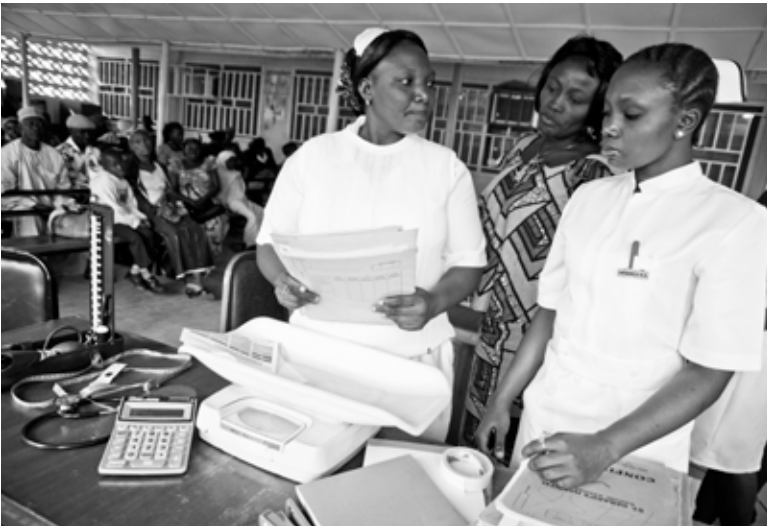
Through training and clinical mentoring, AIDSRelief assists health care workers in developing the skills they need to treat chronic illnesses such as HIV infection.

Consistent with AIDSRelief's capacity strengthening approach, providers and managers began with theoretical work, and then pairs of AIDSRelief and facility staff worked side-by-side to master the skills and systems required to do their jobs well. Regular site visits, assessments, mentoring, and supportive supervision allowed staff to maintain and enhance these skills. Improved staff capacity and ongoing technical assistance also can help address the challenge of staff attrition in health facilities, a substantial problem in Nigeria and most resource-limited environments. Ongoing capacity strengthening helps existing personnel work more effectively even when understaffed and helps new hires rapidly get up to speed when there is turnover. Furthermore, staff who do leave can carry these improved skills with them to other positions, thus cross-fertilizing the health system even in states or facilities where AIDSRelief never had a presence.