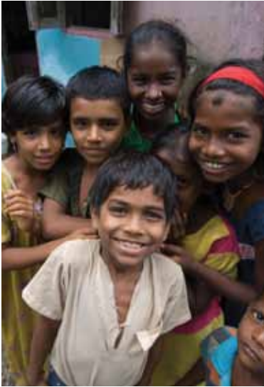
Children gather to greet CRS staff members on a field visit to educational and empowerment projects in the migrant community of Madhavi, northeast of Mumbai, India.

A cause is an underlying factor that exists in the community, organization, or external environment that has brought about a problem. Effects are social, environmental, political, or economic conditions, usually negative, that result from the problem 5 .