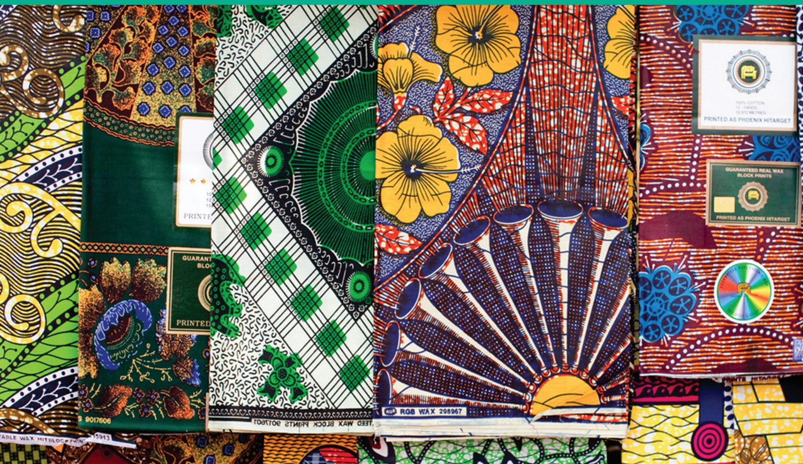
CRS' study on NFI needs for women highlighted that pagnes (cloth) were in high demand due to their varied uses: from transporting items during displacement, as clothing for adults and children, and covers for water and food.